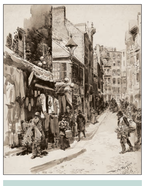
▲ Boston was a center of numismatic activity in the 19th century.

of which still are in business. Each banked on the skills of its in-house "expert numismatist" and served the coin collecting community with various degrees of skill.